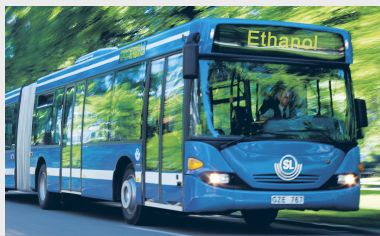
Bus running on biofuel