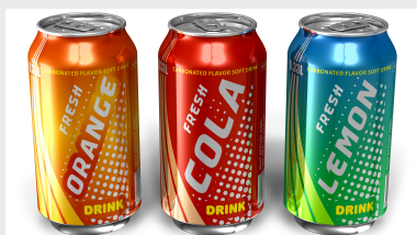
Keeping the fizz in fizzy drinks