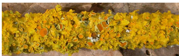
Figure 1. Xanthoria parietina , forming a foliose (leaf-like) lichen in nitrogen-enriched habitats.