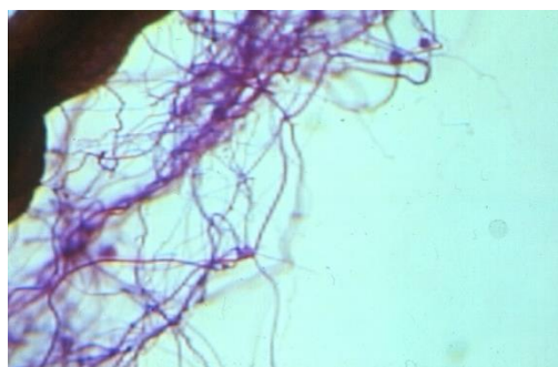
Figure 1. Arbuscular Mycorrhizal Fungal Hyphal (the purple fibres) development in the media around a root (the black structure at the top left of the figure). The hyphae provide a large surface for absorption from the growth media and penetrate the root cells establishing arbuscules in the plant tissue for the transfer of absorbed materials.

with its soil environment ( Figure 1 ). The hyphae give a surface for absorption, which is much greater than that of the root surface area alone. This connection between plant and soil was key to plants being able to survive the hostile environment found on land.