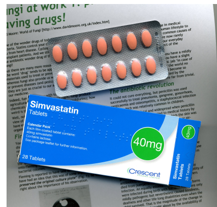
Fig. 3. A Simvastatin prescription. Today, statin drugs have become one of the most commonly prescribed medicines and are credited with saving 7,000 lives a year in the United Kingdom alone!

Most of us appreciate that if we have too much cholesterol, the human body is not able to use up the excess and it sticks to the inside walls of our blood vessels. This build up reduces the diameter of the vessels, which restricts blood flow. If blood vessels that supply the heart become clogged, this can cause a heart attack because the heart muscle does not receive enough oxygen to function properly. To control heart disease, it is important that humans regulate their cholesterol level.