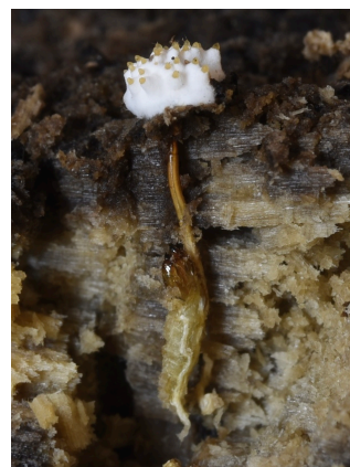
Fig. 4. A Tolypocladium sporophore growing out of a beetle larva the fungus has parasitised.

Cyclosporine is another crucial wonder drug of today that enables long-term transplants of livers, kidneys, hearts, lungs and bone marrow; as well as auto-immune disease treatments. This compound is produced by the insect-pathogenic fungus Tolypocladium inflatum (Fig. 4).